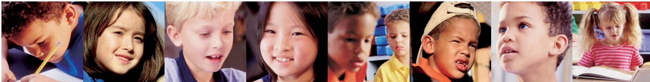
PHOTOGRAPHS HAVE BEEN POSED BY MODELS.